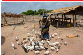
Oufou, young girl, beneficiary of Youth Livelihood program.